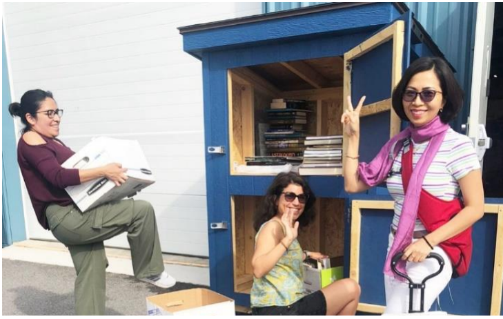
Unloading Book Bins - The Penn State Humphrey Fellows are up for a good workout.