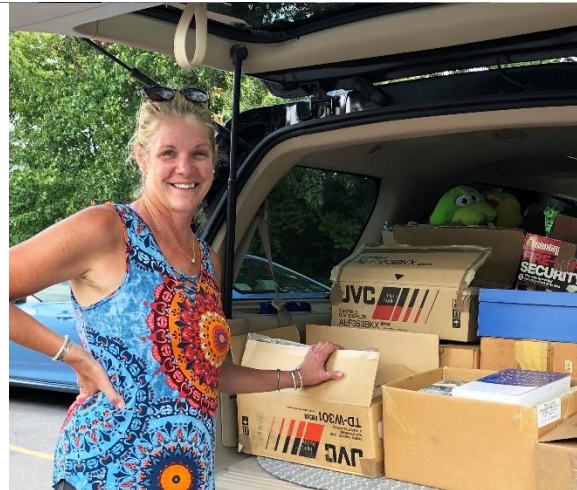
A carload full of books is a beautiful sight.