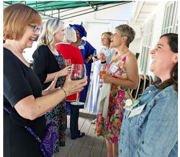
Time to socialize!

About sixty members and guests attended the June 8 th Award & Scholarship Banquet, held at Centre Hills Country Club. With almost no in-person gatherings since Covid began, this was the first banquet since 2019. It was fun to be together again.