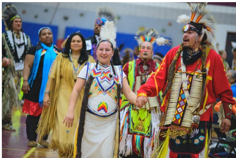
Scene from the 15 th Annual Penn State Powwow.