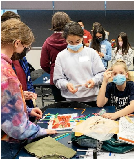
At last month's Penn State Envision event, participants learned through workshops. Pictured: Escape Room (left) and the Archeology of Teeth (right).