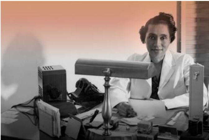
Dickens, a physician and advocate for women's health, preventive care, and health equity for Black women and girls, was influential in her profession from the 1930s until her death in 2001.

commemorating and encouraging the study, observance and celebration of the vital role of women in American history. Learn more: https://womenshistorymonth.gov/