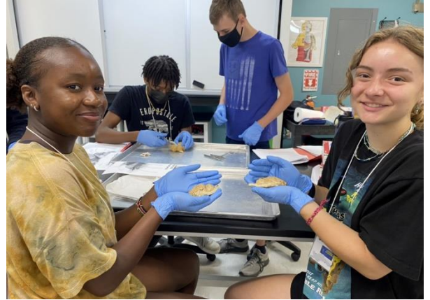
Pre-med Academy campers dissect sheep brains.

but were not able to attend a camp that summer due to the pandemic. Thanks to the generosity of AAUW State College, they were allowed to defer attending Science-U until this year when the camps at Penn State's University Park campus returned to in-person attendance.