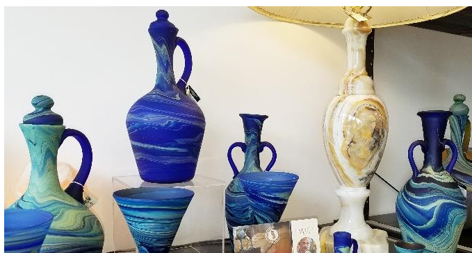
-8- Hand-blown glass by a Ten Thousand Villages artisan.

Ten Thousand Villages is a pioneer in fair trade and is dedicated to breaking the cycle of generational poverty by putting people and the planet first. What began with one woman committed to the concept of women helping women has