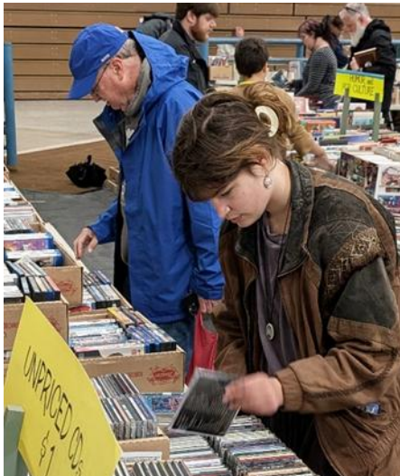
CDs, puzzles, games, and sheet music were also a draw.