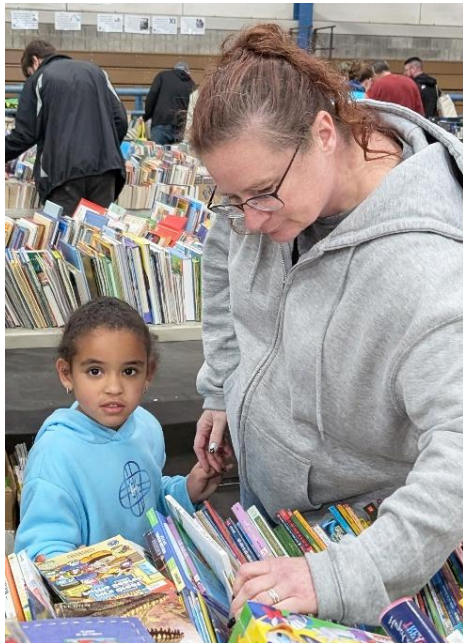
The Children's section of the sale offered 25,000 books for young readers. Where to start!?