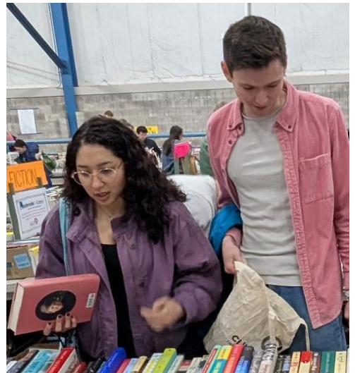
Shoppers enjoyed a fantastic selection of books.