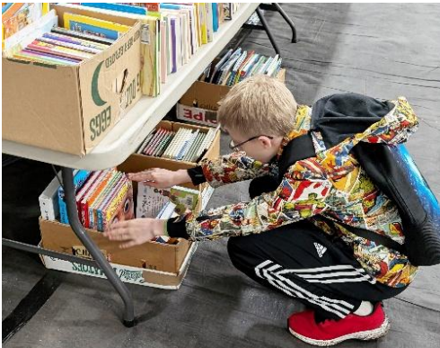
Seeking buried treasures.

Along with heavy traffic related to Penn State graduations, steady rain impacted the start of the sale, bringing significantly fewer shoppers than 2025. However, in 2026, individual shoppers spent more.