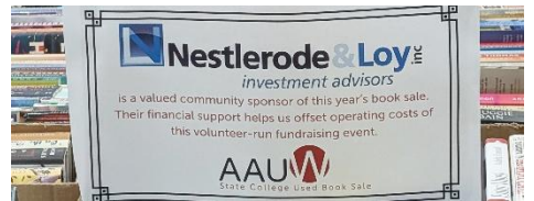
Nestlerode & Loy were the lead business sponsor.