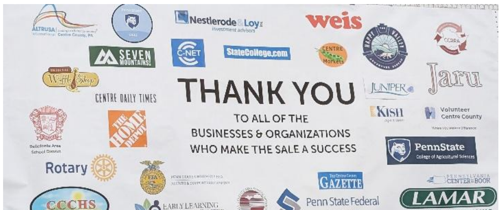
Many local groups assisted with sale expenses and volunteers.