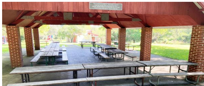
Getting ready for our first potluck at Orchard

Invite a Friend New members will be able to join for a special half-price rate of $46 rather than the $92 standard rate. What a deal!