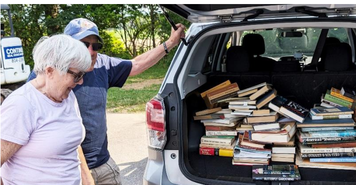
Book donations for the 2025 sale have begun!

The Used Book Workshop reopened June 18, to heavy donations. Book donations are accepted anytime in the outdoor bins. The workshop itself is open and staffed on Mondays, 6-8 pm and Tuesdays and Wednesdays, 9 am-noon.