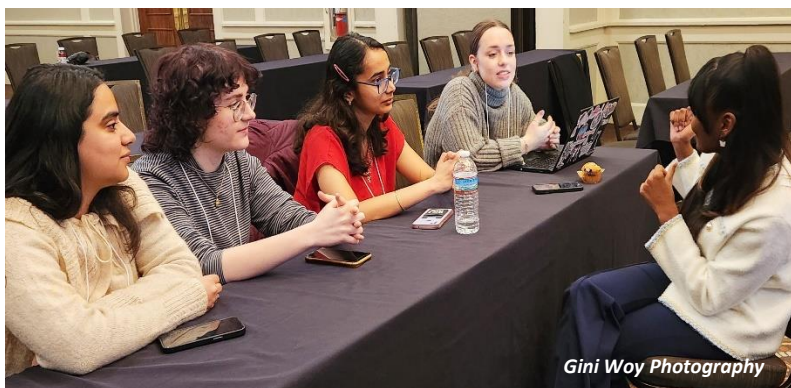
AAUW State College support made it possible for more students to attend the April conference.

The AAUW Pennsylvania Board and I are highly appreciative of the donation made by AAUW State College for the 2023-2024 year. The $5,000 commitment enabled us to fully support three undergraduate students' attendance at the AAUW Pennsylvania Conference in Harrisburg ($2,300); provide student impact mini-grants ($1,442); and send two students to NCCWSL at College Park, Maryland ($1,130).