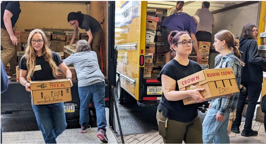
A dedicated crew at the book workshop loaded 4,400 book boxes onto trucks at the workshop. A large team at the Ag Arena was ready to unload them, making Move-in Night seamless.