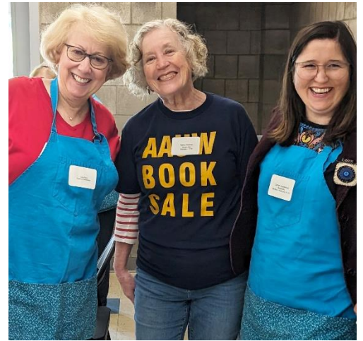
Dozens of branch members volunteered at the sale. What better time to wear an apron?