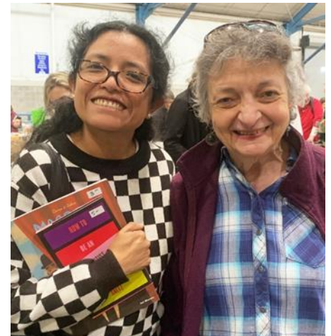
Mother's Day: a perfect way to spend it with Mom.