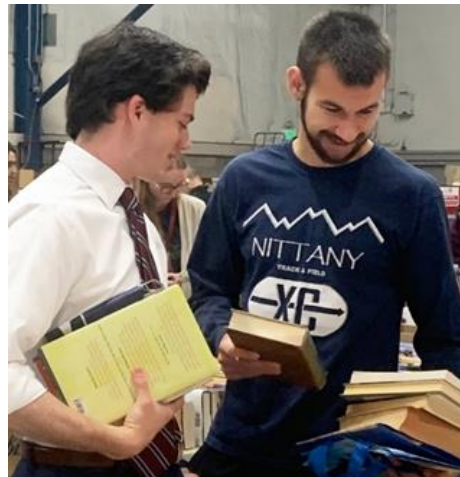
Reading paper books is not such a novel idea.