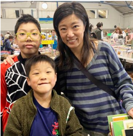
25,000 children's books led to a massive treasure hunt.