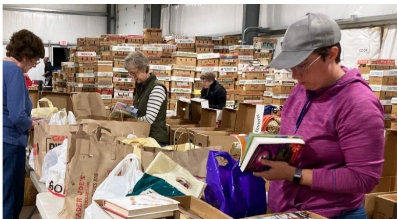
Above: The Monday night workshop crew work hard and have fun, all at the same time!

The Used Book Workshop will be closed the week of December 24 and will reopen January 2 . Book donations may still be made, 24/7, using the outdoor blue book bins.