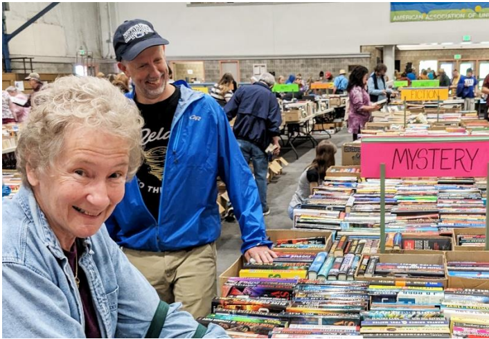
A book lover’s dream.

Everything about this year’s sale was unforgettable – not just the volume of books. From the wait in line for early Saturday shoppers (way too long), to grossing the most money ever at the sale, $187,562 - such a surprise. A thousand thanks to the book donors, volunteers, and the shoppers! Working together, we made it all happen.