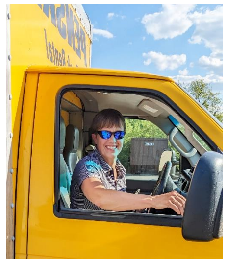
Above left: Volunteers load boxes onto trucks.