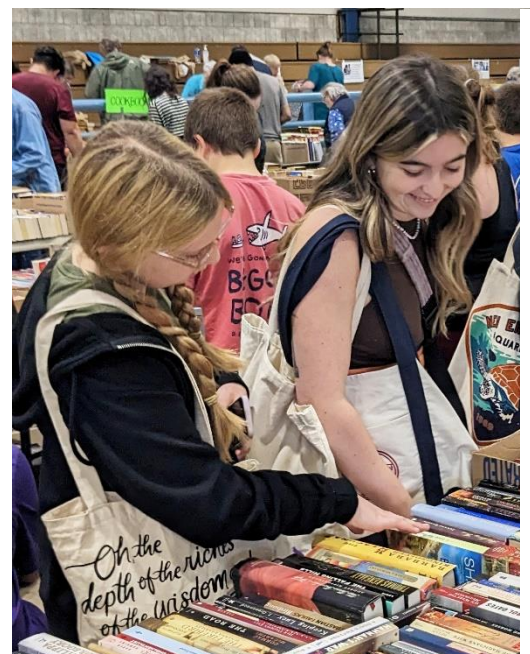
Fun to find those treasures!